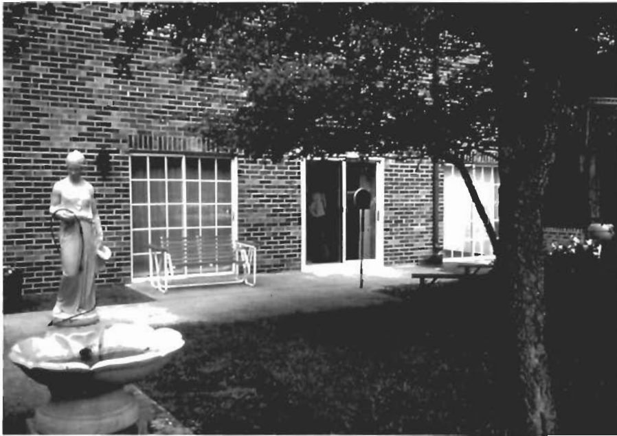
OUTDOOR FREEDOM —On-grade secure courtyard with birdbath provides choice and diversion.

residents. Supports include planters for residents to have contact with the earth, non-poisonous plants, and visibility of the unit door so residents can find their way back easily. In particular, having the outdoor space on the same level and with staff offices located to allow easy surveillance will maximize the residents' use of such space at their own discretion. Both staff and residents will be less agitated and residents will derive the greatest benefits from contact with daylight, changes in the seasons, weather changes and contact with earth and plants.