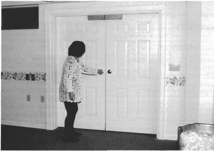
EXIT CONTROL —Delayed door openers and touch pads located in the flower border provide control and unobtrusiveness.

Many more outcomes referred to in the body of the E-B Model are drawn from the literature and from our expert panel's comments. The full list (see Appendix) represents part of the still wider range of therapeutic outcomes that further model development and research will identify. The description of therapeutic outcomes in this article are those that are influenced by the physical environment. They demonstrate both possible outcomes for each category and the quality of the outcomes the physical environment influences.