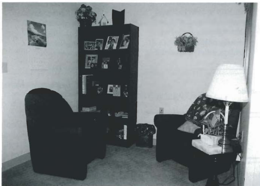
RESIDENTIAL SCALE — Easy chairs and bookshelves help residents feel at home.

smaller settings that are more institutionally furnished and operated, residents will become restless and disoriented. Staff, who will have to carry the burden of stimulating and helping to orient residents, will become frustrated and tired. • Low Size/High Familiarity: In larger units that nevertheless are furnished residentially, residents will be overstimu-