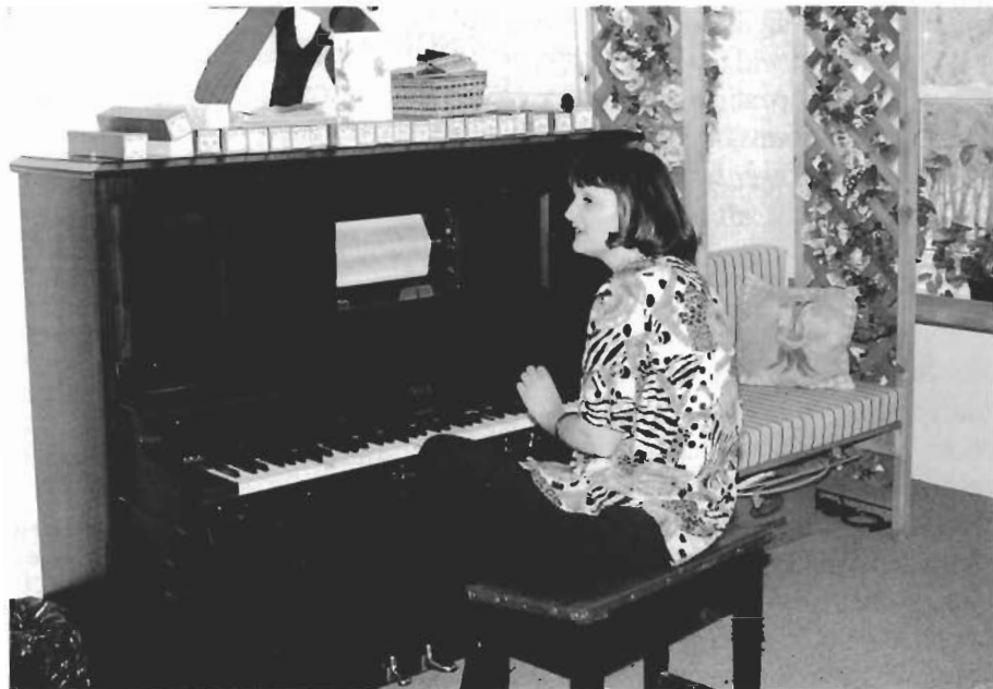
SENSORY COMPREHENSION — Player piano and old familiar tunes are easily understood.

amount of staff stress in dealing with residents reacting to auditory and visual noise will be in settings with moderate amounts of highly meaningful sounds, sights, smells and feelings. These settings will also support residents' cognitive abilities and have the greatest number of residents engaged in meaningful independent activities.