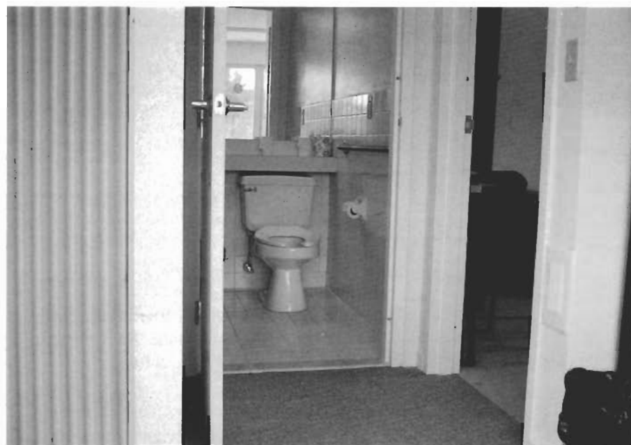
AUTONOMY SUPPORT — Visible toilets help residents remain more independent.

support are designed with the assumption that residents cannot contribute to their own care and need constant help and supervision. Unit design requires that staff control resident behavior and be continually alert to possible accidents.