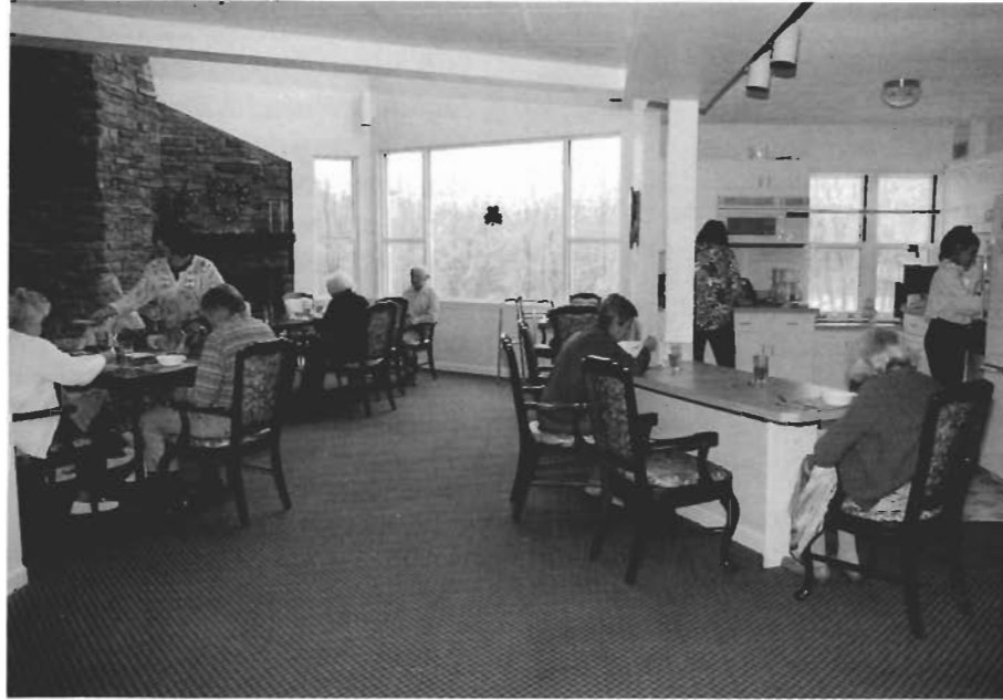
COMMON SPACE STRUCTURE —A dining room and a linked therapeutic kitchen provide differentiation in common spaces.

also have therapeutic side effects. When each roommate has some control over a defined physical space, including windows and lighting, and when roommates are compatible, there may be social advantages for some residents to share a room. These advantages may outweigh the disadvantages of lost privacy, with resulting outcomes similar to units with more single bedrooms.