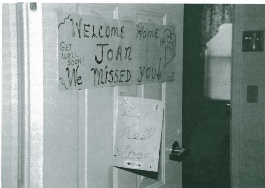
INDIVIDUAL AWAY PLACES —Bedrooms with residents' personal objects serve as social retreats.

board that each resident is encouraged to decorate separately with personal mementos would receive a lower rating. SCUs rated lowest on individual away places have only ward sleeping arrangements in which neither residents nor their families have any opportunity to provide a personal touch.