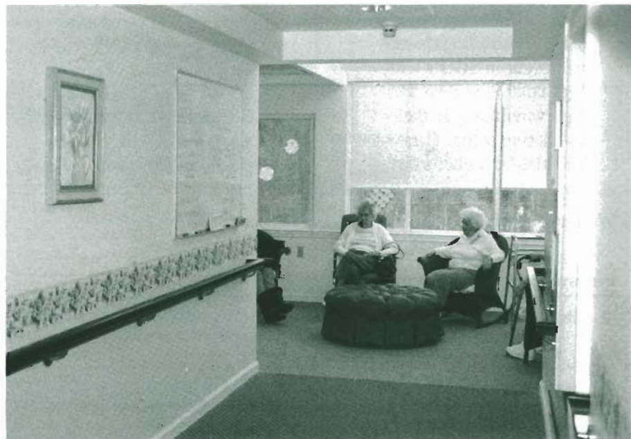
WANDERING PATHS —Paintings and activity boards along pathways increase interest.

One side effect of experience along pathways such as engaging artwork, changes in texture, and views into activity areas is that they make the trip more interesting for residents. This in turn provides residents with motivation to stop and attend to an object, view or experience, and eventually to move to the next place along the pathway. It also provides staff with environmental aides to help residents move to a destination or along the